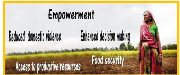
(Google free to use images)

Target 5.c 'Adopt and strengthen enforceable legislation for the promotion of gender equality and empowerment of women / girls at all levels.'